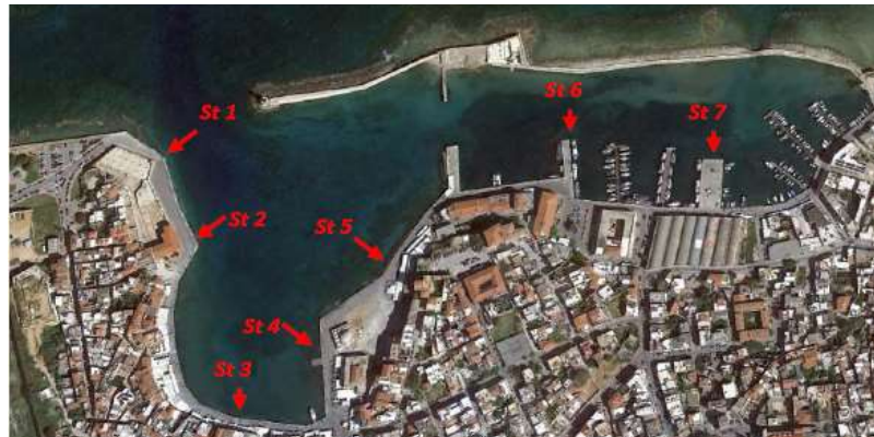
Figure 1: Map of the Venetian harbor, showing the 7 sampling locations.

throughout the period of February to October 2014, in order to obtain a more uniform (both in high- and low-touristic season) view of the water quality.